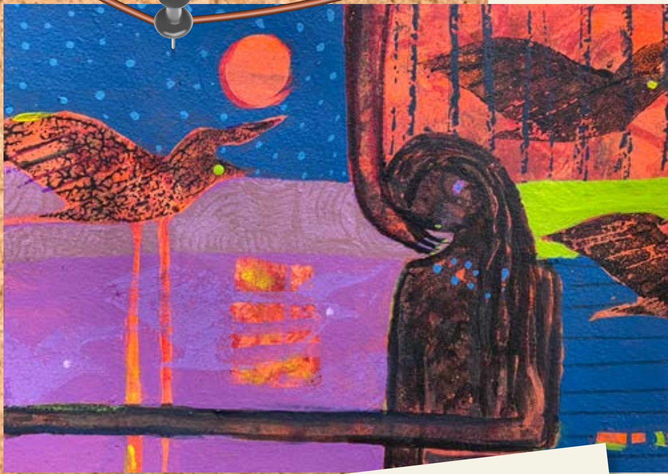
Acrylic color on paper 14.8 x21 cm.

Identity is what differentiates you from others. When I hear the word identity, a question comes to my mind: Who am I? As a visual artist, practicing art is a kind of exclusivity and freedom to express oneself without restrictions. My artistic identity lies in expressing my feelings, experiences and events that I share in the form of a work of art. In art, there is a message that transcends languages, cultures, beliefs and even time. It is natural for every artist to express himself and his identity in his own way and his own view, and identity in itself is an art, as it differs from one person to another even if there is a similarity in some things, there is always something special and different that distinguishes one individual from the other.