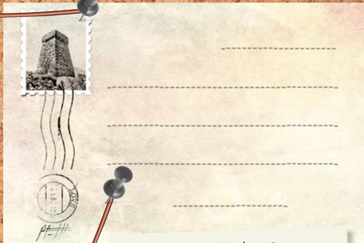
Reem Maghram – Our green land