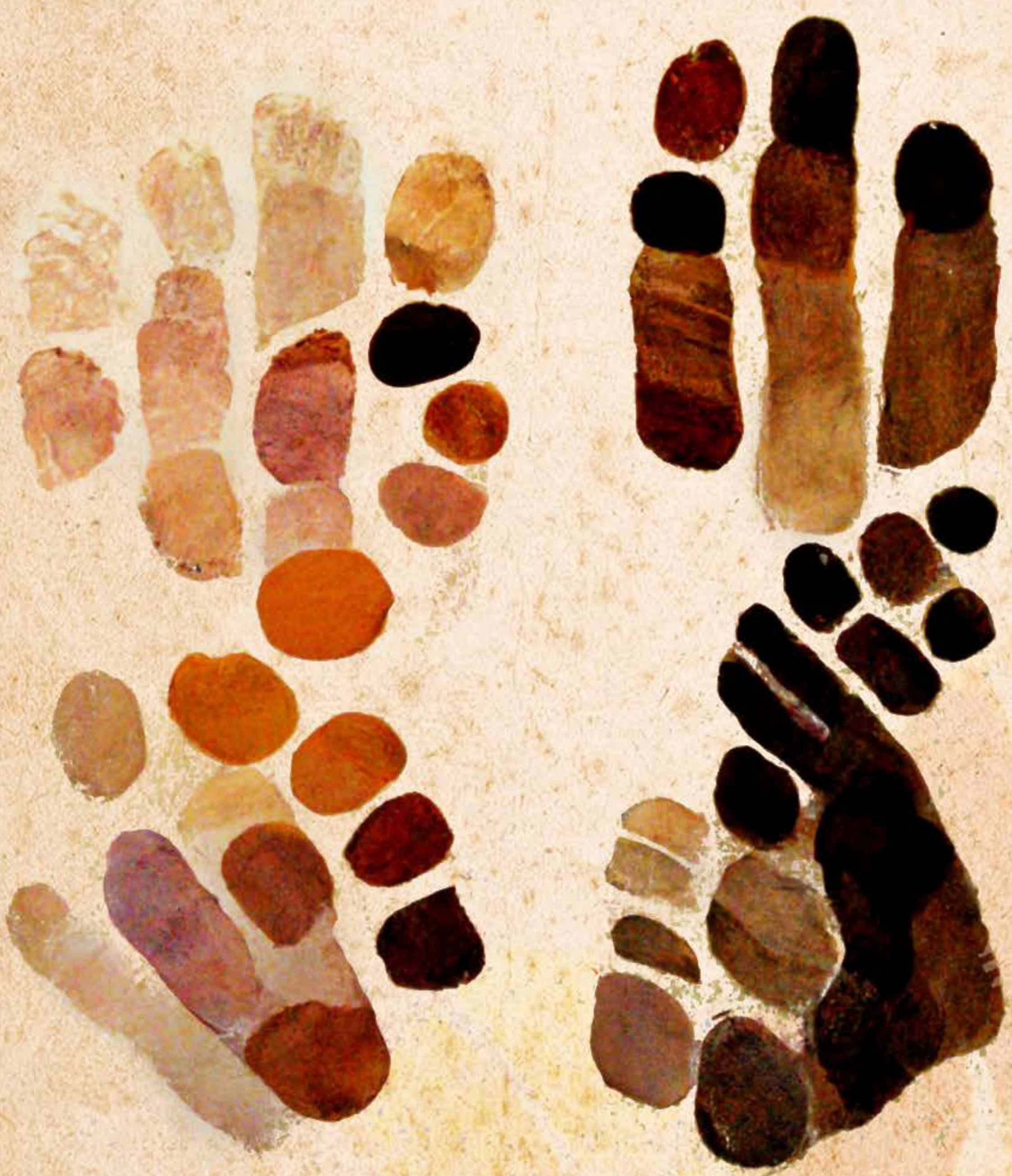
AI generated art, with input from Rym Al-Ghazal.