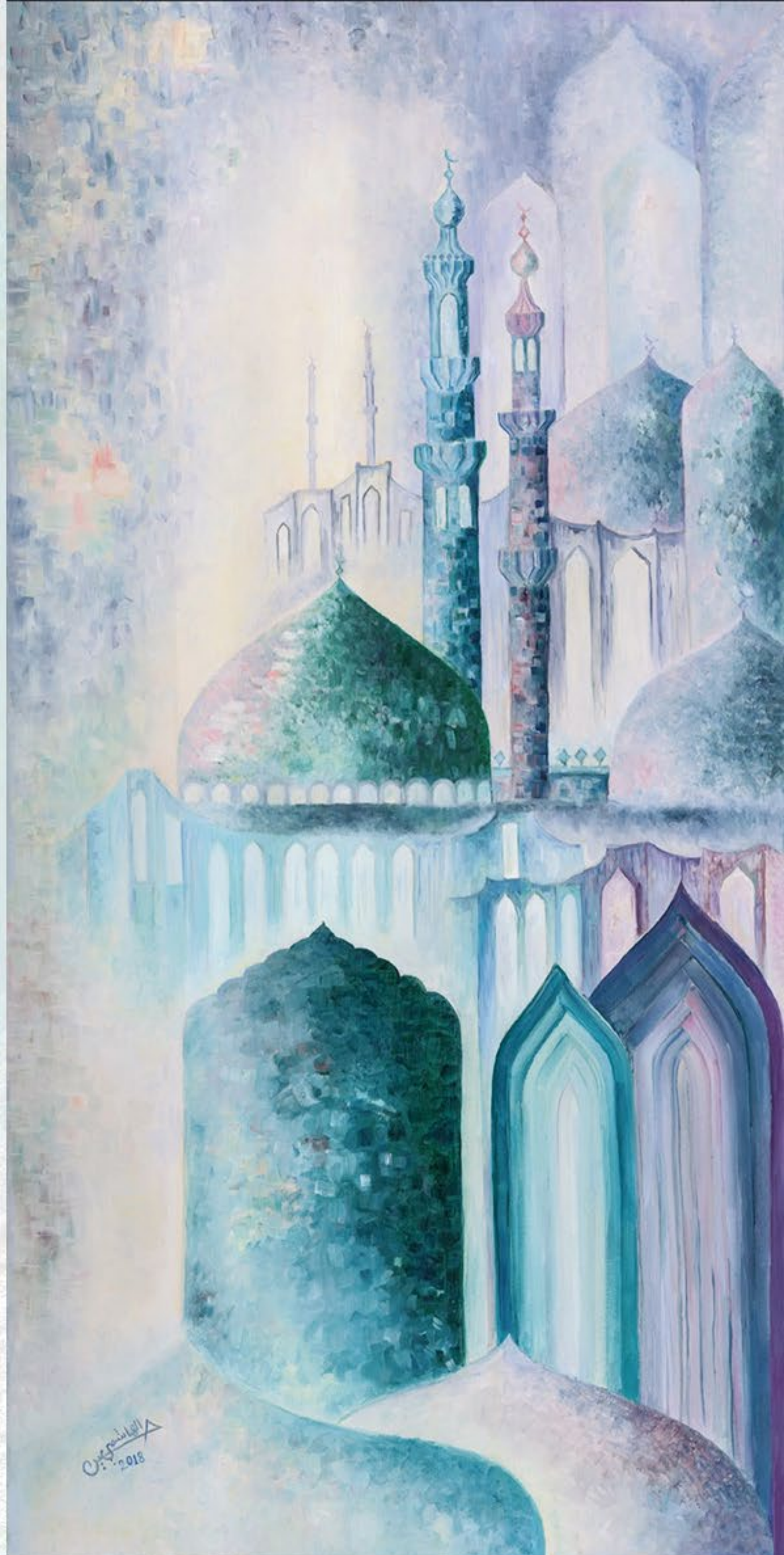
'Dimensions,' by artist Husain Al-Hashmi.