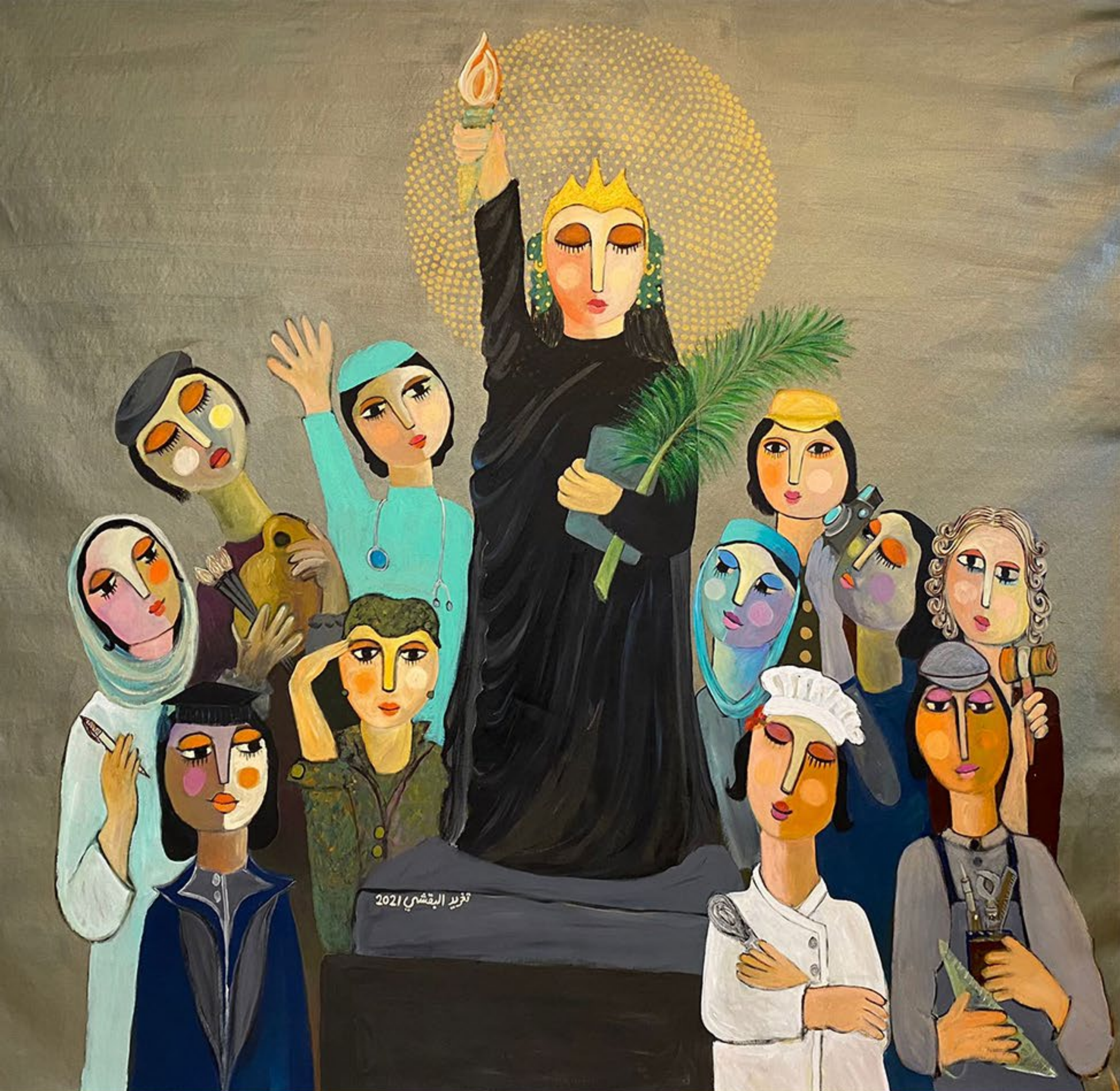
'Empowering Saudi Women,' acrylic on canvas, 2021, by Tagreed Al-Bagshi.