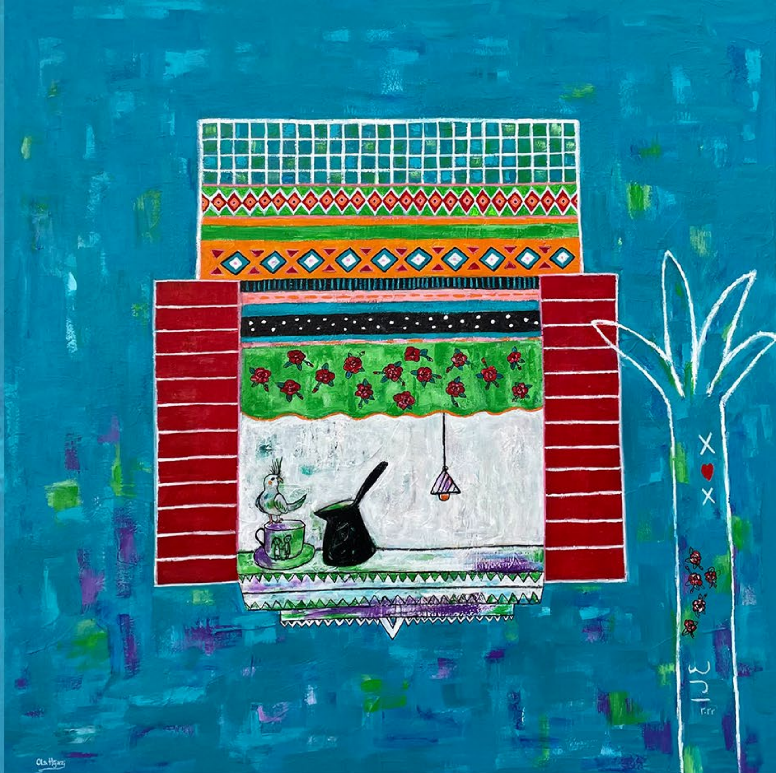
'Open window,' original new art debuting in Ithraeyat by Ola Hejazi.